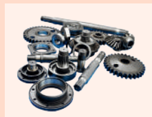
High Quality Spare Parts