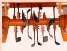
Boron Steel Blades