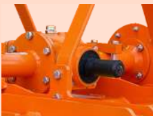
Heavy Duty Gearbox