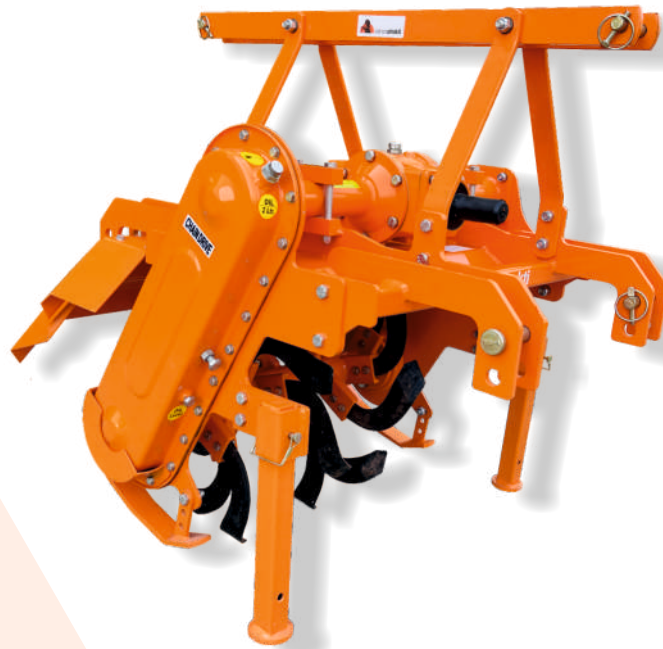
Size Available / Tractor Power (HP)