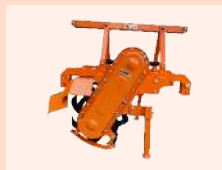
Flexible Spring Assembly