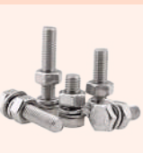
High Tensile Fasteners