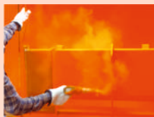
Powder Coated Paint