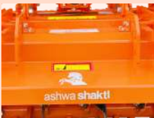
Strong Body Frame