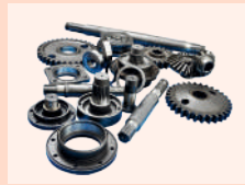
High Quality Spare Parts