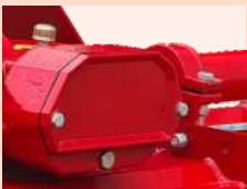
Heavy Duty Gearbox