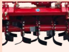
Boron Steel Blades