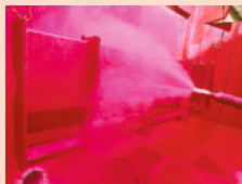
Powder Coated Paint