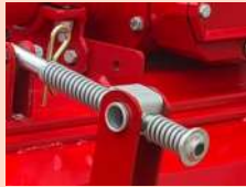
Flexible Spring Assembly