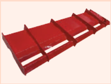
Strong Body Frame